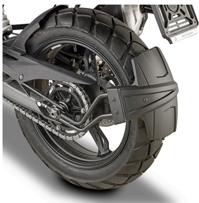
RM5126KITK Specific kit to install the spray guard KRM01, KRM02